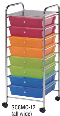
SC8MC-12 (all wide)