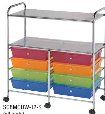
SC8MCDW-12-S (all wide)