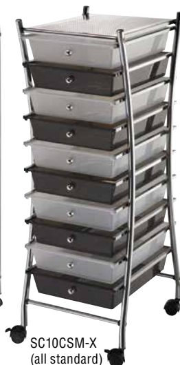
SC10CSM-X (all standard)