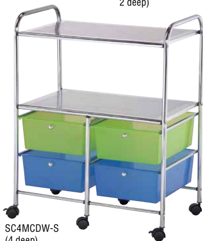
SC4MCDW-S (4 deep)