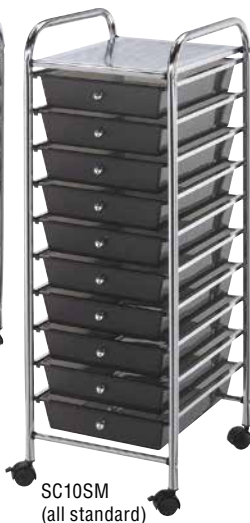
SC10SM (all standard)