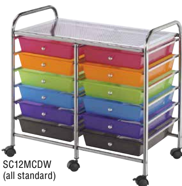
SC12MCDW (all standard)