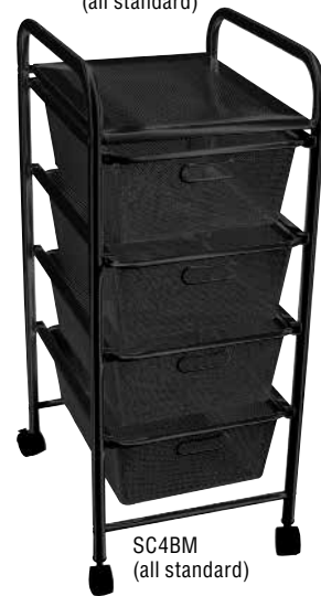
SC4BM (all standard)