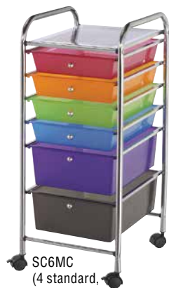
SC6MC (4 standard, 2 deep)

Replacement parts are available on page 27.