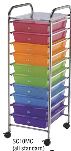
SC10MC (all standard)