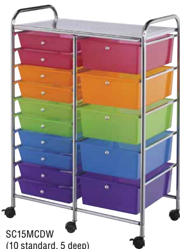
SC15MCDW (10 standard, 5 deep)