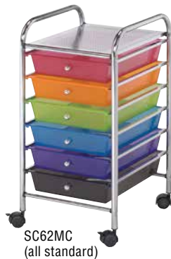
SC62MC (all standard)