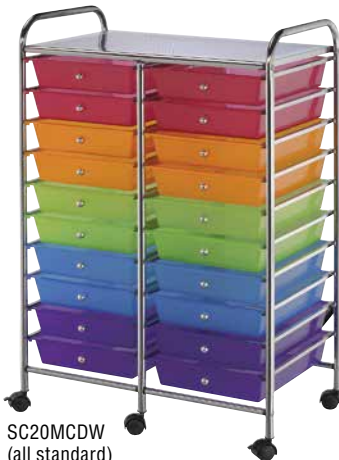
SC20MCDW (all standard)