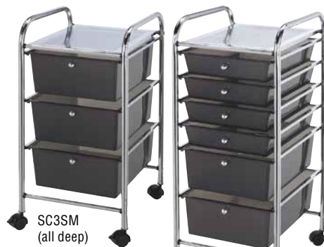
SC3SM (all deep)